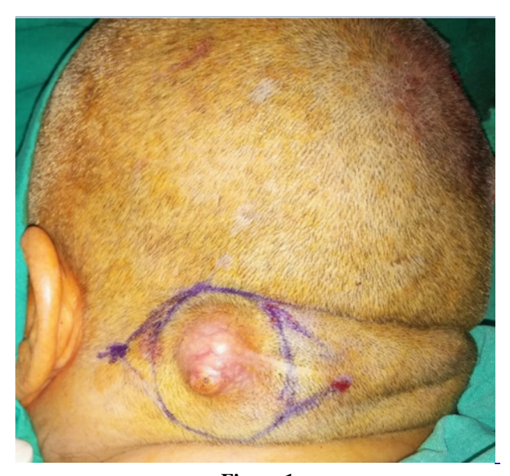
Figure 1 Clinical appearance of the tumor was shown

Sixty-two years old female patient admitted to our Otorhinolaryngology department for a recurrent scalp lesion. She had a history of SCC in the same region treated with wide local excision 9 months ago. She had no chronic sunlight or occupational chemical exposure history. On her physical examination there was a 3x3 cm. nodular exophytic fungating mass on left side of the occipital region of the scalp (Figure 1).