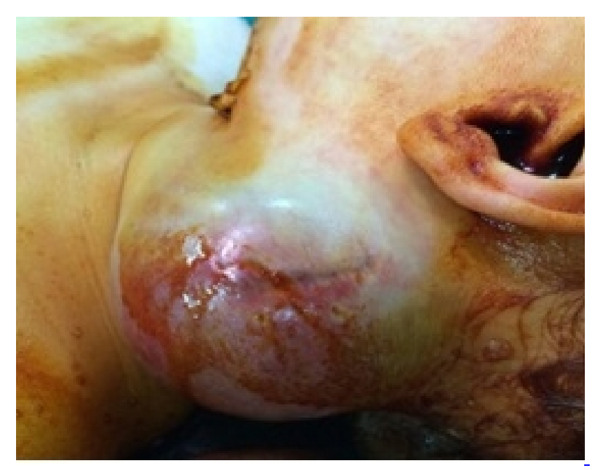
Figure 2 The mass on left side of neck before operation