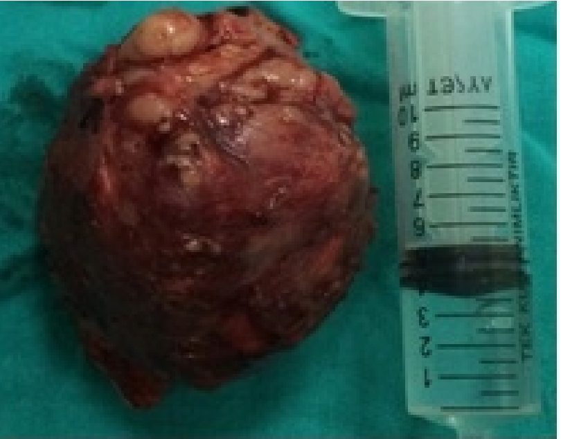
Figure 3 Total excision material

Surgical site was closed in accordance with the anatomic plan and a hemovac drain was placed. Post-operative first day 75 cubic centimeter (cc) hemorrhagic fluids were drained and 40 cc on the second day. As no fluid came from drain, the drain was removed on the third day. At the end of the first week, the suture was taken out and discharged as no problem was noted. The patients were followed up monthly for six months. After 12 months follow up, there is no clinically significant problem.