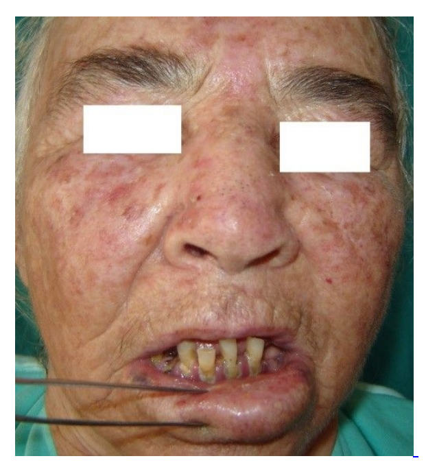
Figure 1 Tumor on the lower lip

Histopathology report of a previous incisional biopsy performed 15 days ago was reported as pleomorphic adenoma. There was no palpable lymph node on her neck examination. We performed complete removal of tumor from lower lip and repair of tissue defect using Bernard-Burow technique (Figure 2).