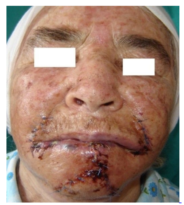
Figure 2 Postoperative 5th day, view of patient

Histopathology report of a previous incisional biopsy performed 15 days ago was reported as pleomorphic adenoma. There was no palpable lymph node on her neck examination. We performed complete removal of tumor from lower lip and repair of tissue defect using Bernard-Burow technique (Figure 2).