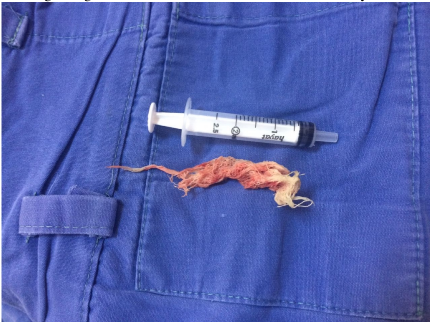
Figure 2 A piece of 4 cm long gauze removed from the airway passage.