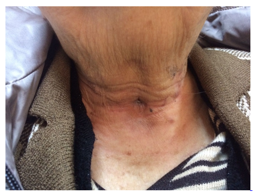
Figure 4 Decannulation, one month follow-up. Note that stoma was completely closed.

Two weeks later, the stomal infection regressed and endoscopic evaluation of the tracheal lumen was performed, neither grannulation tissue formation, nor airway obstruction was observed. She was decannulated, a month later (Figure 4). She had no further complains.