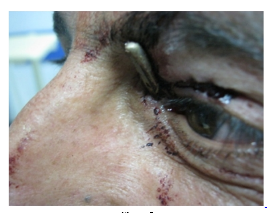
Figure 5 Patient after acident