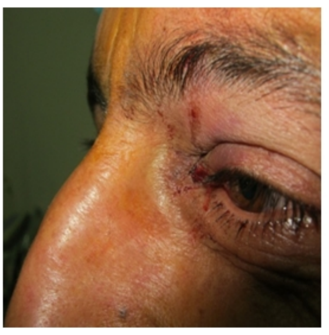
Figure 9 Patient after removal

The patient was taken to the operating room immediately. Foreign body was removed under local anesthesia (Figure 8). Foreign body was found to be about 4 cm in size. No complications were seen after removal. Visual and eye movements were evaluated natural (Figures 9). Patient was discharged one day later.