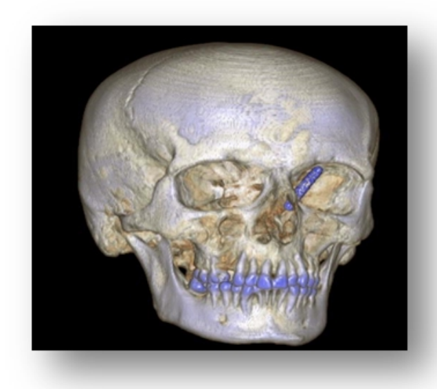
Figure 4 3D CT scan