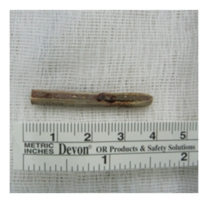
Figure 7 Foreign body

The patient was taken to the operating room immediately. Foreign body was removed under local anesthesia (Figure 8). Foreign body was found to be about 4 cm in size. No complications were seen after removal. Visual and eye movements were evaluated natural (Figures 9). Patient was discharged one day later.