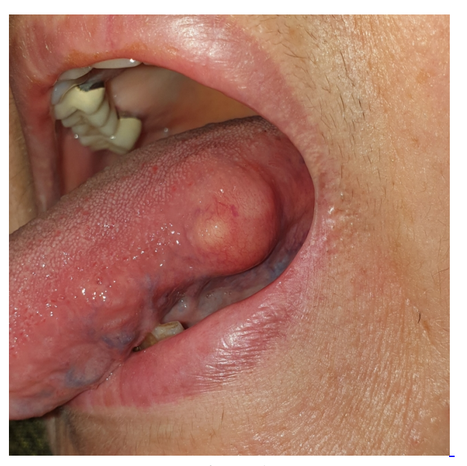
Figure 1 The mass on the left lateral border of the tongue

A 64-year old female patient without any significant medical history applied to our clinic with a painless mass located at the left lateral border of her tongue for six months. The mass was described by patient as a slowly but gradually growing tumor, causing stiffness, decrease in the quality of voice and difficulty in mastication. Oral examination revealed a 15 x 15 mm, semielastic and semi-mobile mass at the left lateral border of the tongue, covered with nonulcerated lingual mucosa.