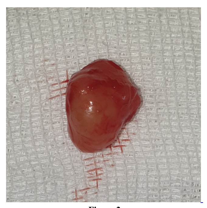
{\bf Figure~2} \\ Well-demarcated, non-capsulated, whitish gray, elastic and solid tumor after removal

Histopathologically, tumor was well circumscribed with no distinct capsule.