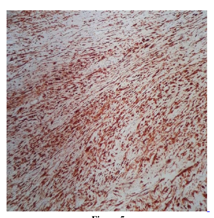
Figure 5 S-100 positive staining (IHC, original magnification x100)

There were no Verocay bodies or Antoni areas. Most of the neoplastic cells were strongly positive for S-100 protein with immunohistochemical stain.