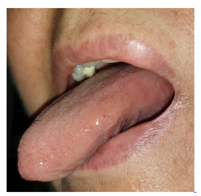
Figure 6 Patient after one year of follow-up with no recurrence