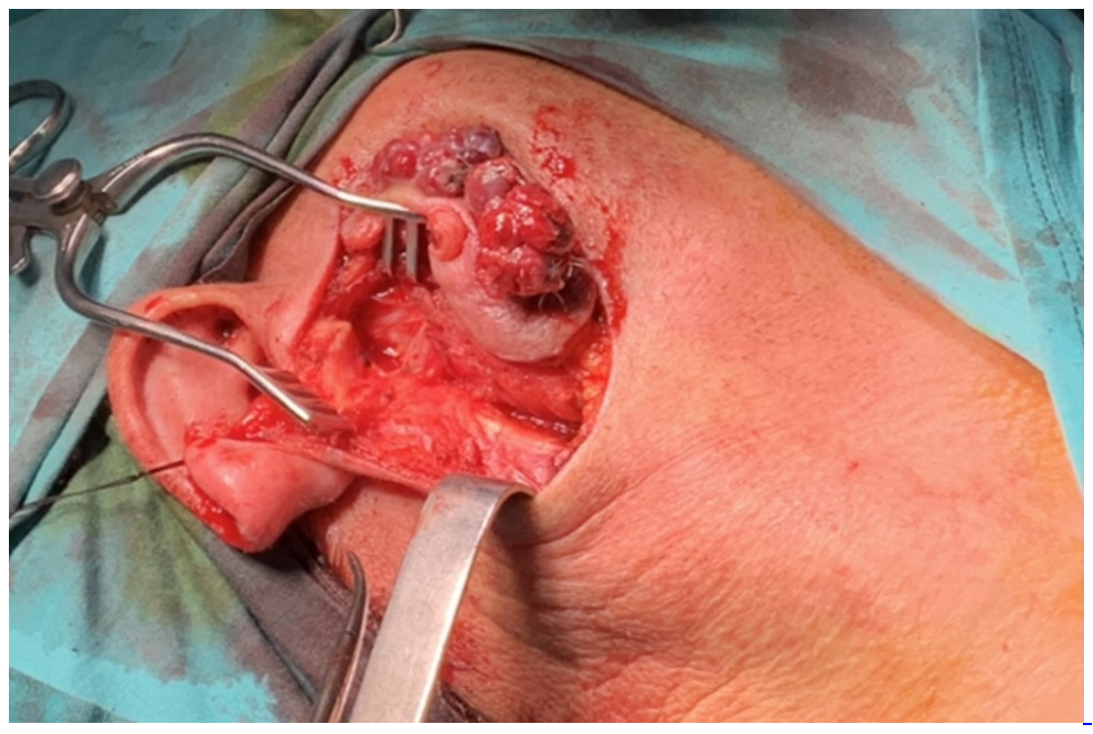
Figure 3 Intraoperative view of the parotid lesion

Positron emission tomography-computerized tomography (PET / CT) imaging revealed 33x26 mm hyper metabolic (SUV max: 4.9) mass in the right parotid region with irregular borders. No other pathological involvement was observed in the rest of the body. The patient had right radical nephrectomy due to RCC, 20 years ago and received 6 cycles of cisplatin, carboplatin and etoposide chemotherapy owing to small cell carcinoma originating from the upper lobe of the right lung, 4 years ago. Fine needle aspiration biopsy (FNAB) was performed for the parotid lesions and reported as renal cell carcinoma metastasis. Total parotidectomy including skin lesions covering the parotid gland were performed (Figure 3).