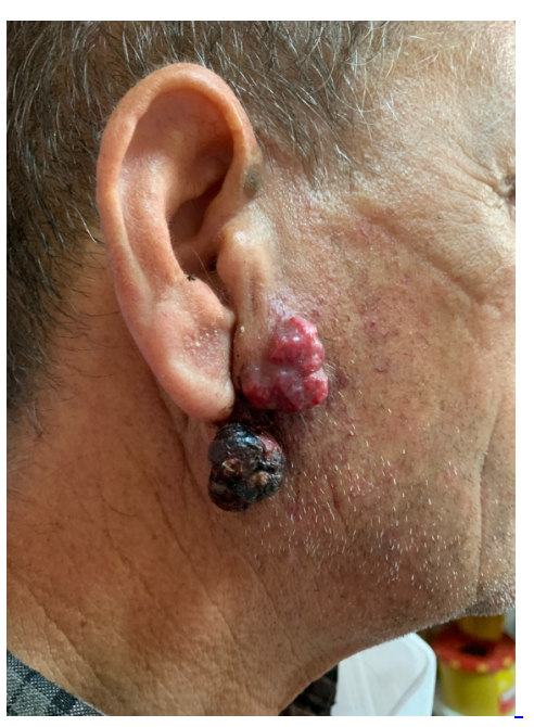
Figure 1 Profile view of a patient with parotid gland metastasis of renal cell carcinoma

First patient is a 64-year-old male who admitted with a progressive swelling in the right parotid had two protruding lesions on the parotid region skin. The lesions were 2 cm in size (Figure 1).