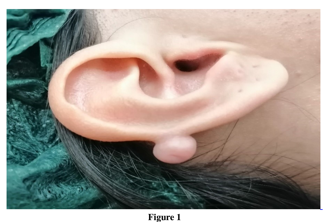
Pre-operative view of fibroepithelial polyp (FEP).