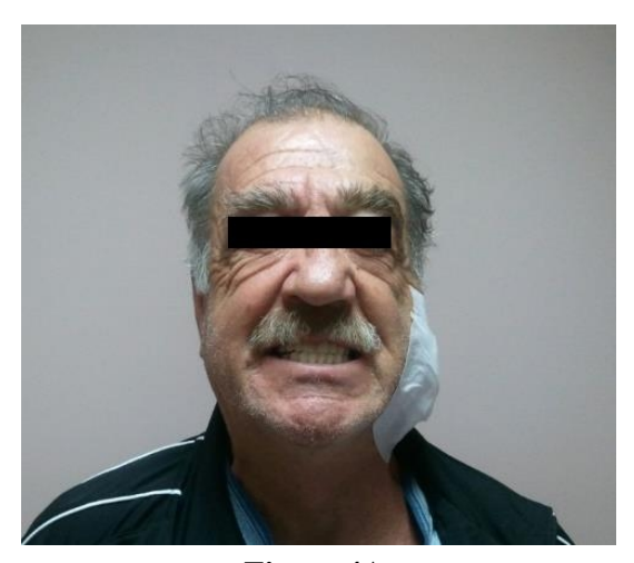
Figure 4A Postoperative pictures of patient

A large suction drain was left 4 days to make sure that the skin flap adherence was completed through the parotid bed. The patient was given intravenous cefazoline sodium postoperatively. Histological examination revealed a pleomorphic adenoma of the parotid gland. Facial nerve functions were intact postoperatively (Figure 4). The patient was regularly followed and there were no cases of tumour recurrence.