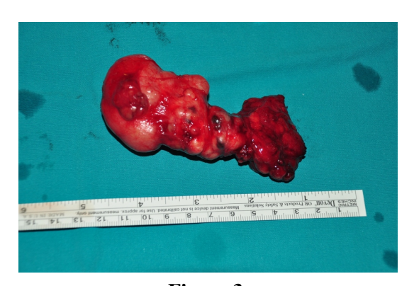
Figure 3 The macroscopic appearance of the parotid tumor

A large suction drain was left 4 days to make sure that the skin flap adherence was completed through the parotid bed. The patient was given intravenous cefazoline sodium postoperatively. Histological examination revealed a pleomorphic adenoma of the parotid gland. Facial nerve functions were intact postoperatively (Figure 4). The patient was regularly followed and there were no cases of tumour recurrence.