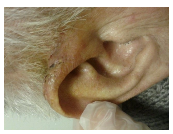
Figure 1 Appearance of the auricle suggesting otophyma

A 65-year old male presented with a two month history of an erythematous plaque on the posterosuperior localization of ear. He was investigated at the Başkent University both of Otorhinolaryngology and Dermatology clinics together. He was also a hemodialysis patient because of kidney failure. The patient complained of pain and pruritus. He had central facial erythema (most prominently on the cheeks) with telangiectasias. Our examination revealed that the lesion with plenty of comedones on the erythematous ground without ulceration. It was posterosuperior localization of auricula which was limited posteriorly to the postauricular sulcus . It was resembling an otophyma with inspection (Figure 1).