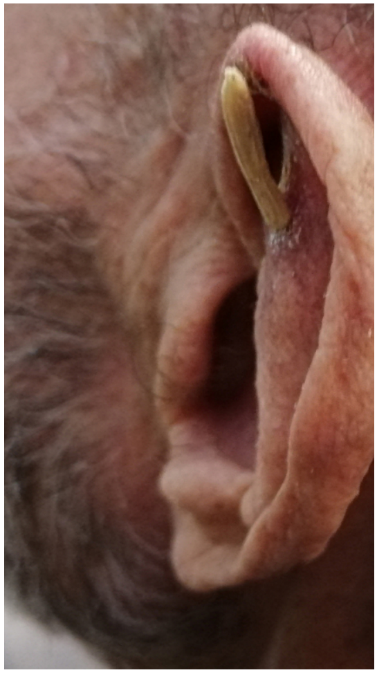
Figure 1 Cutaneous horn on the left ear antihelix

There is scar tissue in the excised area in the 6-month follow-up examination. Complete recovery was achieved without relapse. The patient is still in our follow-up.