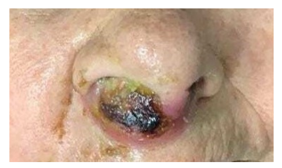
Figure 1 A crusted mass lesion obliterating the right nasal vestibule

A 64-year-old female patient with a complaint of an ulcerated, crusted lesion located in the right nasal vestibule, which started about 1 month ago and showed progressive growth, was admitted to the ENT outpatient clinic. The patient reported no other complaint apart from the lesion and in the physical exam, an ulcerated, crusted 3x3 cm mass in the right nasal vestibule that deviated to the left in the columella and obliterated the right nostrils almost completely was observed (Figure 1).